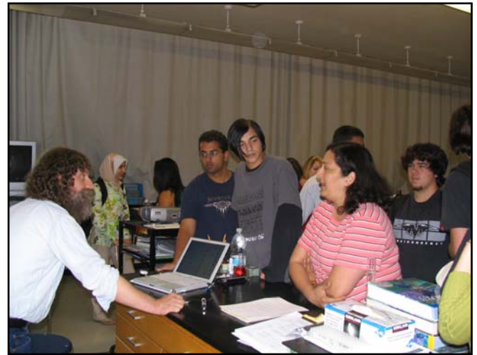
Dr. Robert Sapolsky at San Jose High Academy, San Jose.

“People frequently ask me why I devote so much time to seeking out facts about man’s past...The past shows clearly that we, all of us, have a common origin and that our differences in race and color and creed are only superficial.” – Dr. Louis S.B. Leakey