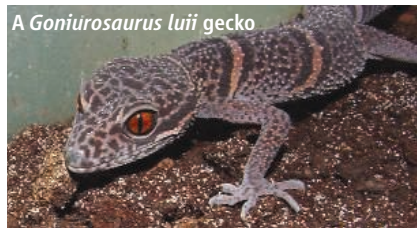
A Goniurosaurus luii gecko

Three of us have published descriptions of new species of restricted-range reptiles and amphibians that tragically aided their commercial exploitation. Immediately after being described, the turtle Chelodina mccordi from the small Indonesian island of Roti (2) and the gecko Goniurosaurus luii from southeastern China (3) became recognized as rarities in the international pet trade, and prices in importing countries soared to highs of $1500 to $2000 each. They became so heavily hunted that today C. mccordi is nearly extinct in the wild (4) and G. luii is extirpated from its type locality (3). The salamander Paramesotriton laoensis from northern Laos was not known in the international pet trade prior to its recent description as a new species (5). Over the past year, Japanese (6, 7) and German collectors used the published description to find these salamanders, and they are now being sold to hobbyists in those countries