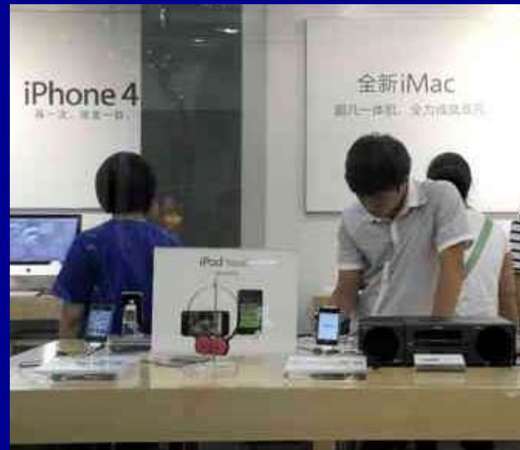
Fake Apple store