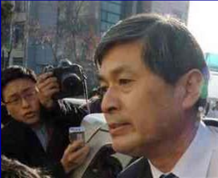
Hwang Woo-Suk (South Korea)