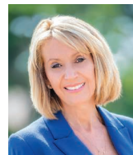
Marcia McNutt Editor-in-Chief Science Journals