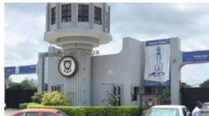
• University of Ibadan