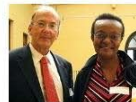
Top AIDS trainees salute Fogarty